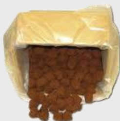
Bulk of 250p