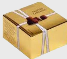
Box of 4x flow pack