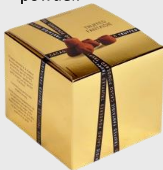
Box of 12x flow pack

Discover the original recipe of Chocolat Mathez since 1934: "the cocoa truffle". Discover all the power of cocoa and the melting heart of plain truffle coated with a fine chocolate powder.